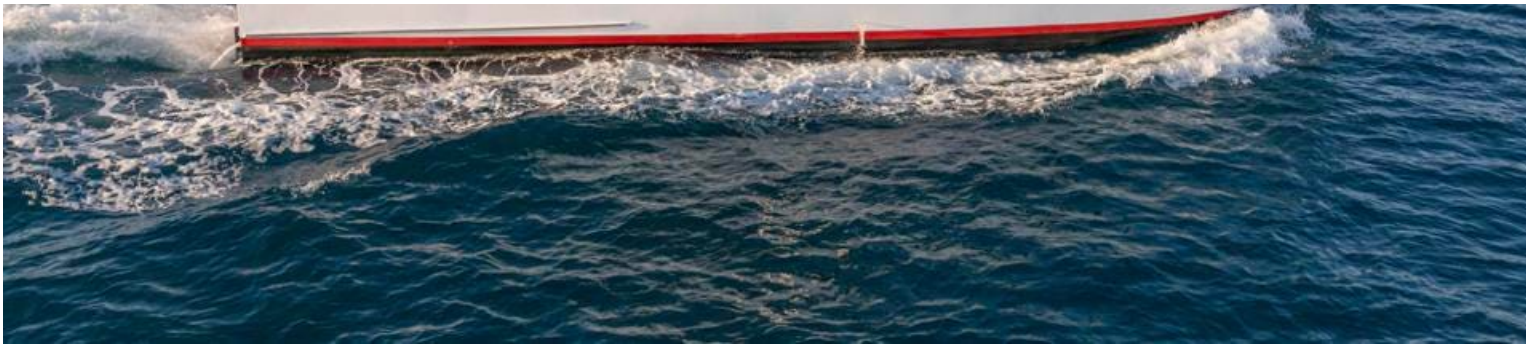
Kingfisher's 1959 Huckins motor yacht KINGFISHER YACHTING