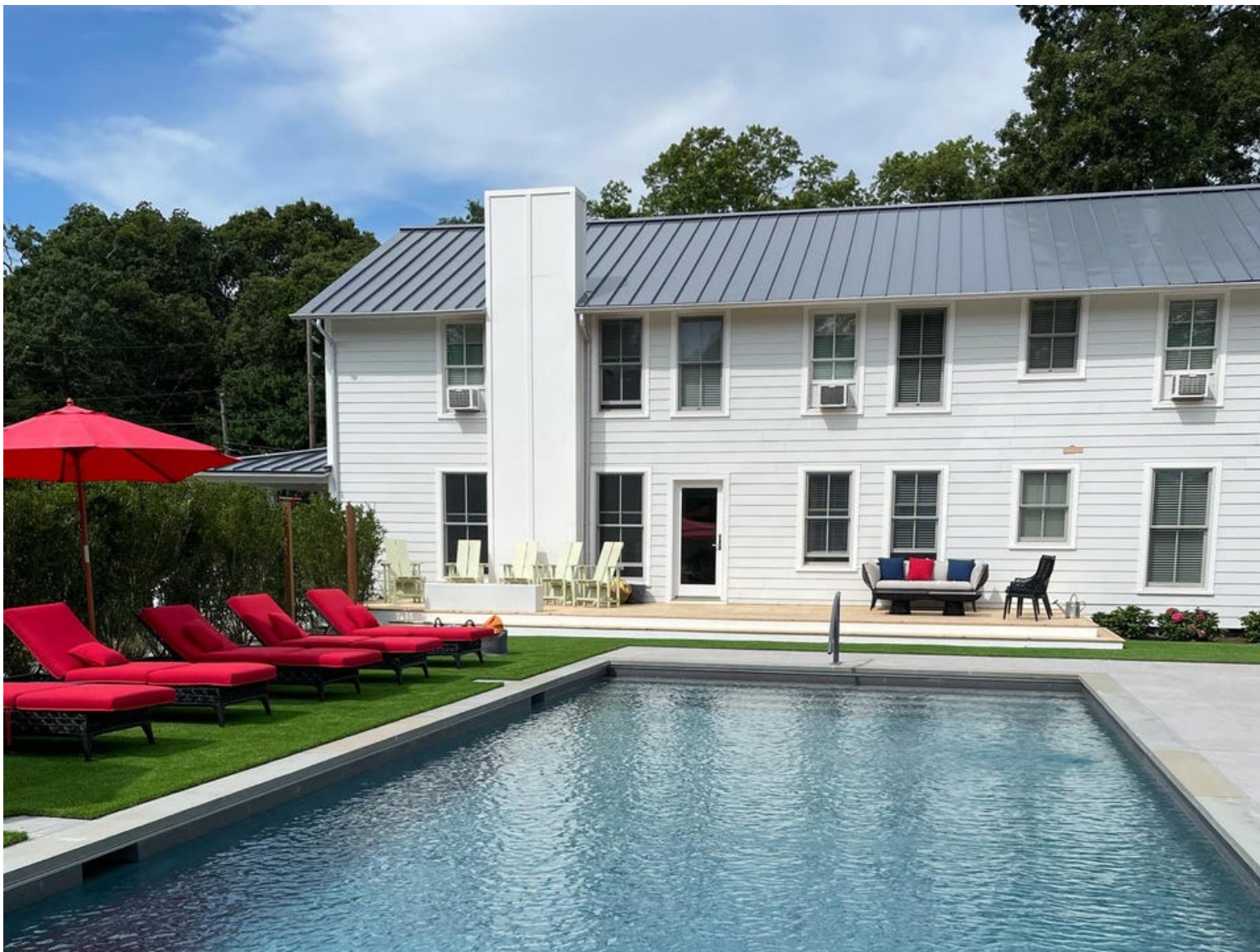
The new pool and chaises by Marcel Wander at Seven on Shelter Island SING DUFFY

Last summer I spent a beautiful weekend at Seven on Shelter Island , Shelter Island's premier luxury bed and breakfast owned and operated by art curator Beth Swanström. My family and I were treated to French breakfasts served effortlessly out of picnic baskets, bikes to get to and from town, a closet full of take-as-you-please beach gear and comfortable, charming rooms that felt at once elegant and chic yet easy and relaxed. I didn't think this lovely inn, located just steps from popular Crescent Beach, could get any better - until it did.