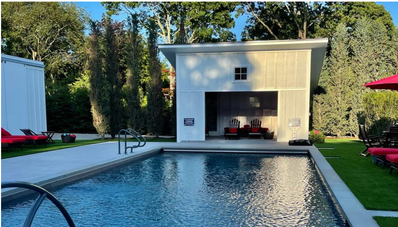
The luxury cabana at Seven on Shelter Island. SING DUFFY

Travers 2021 Results: Essential Quality Wins A Stretch Duel With Midnight Bourbon By A Neck, Miles D Shows