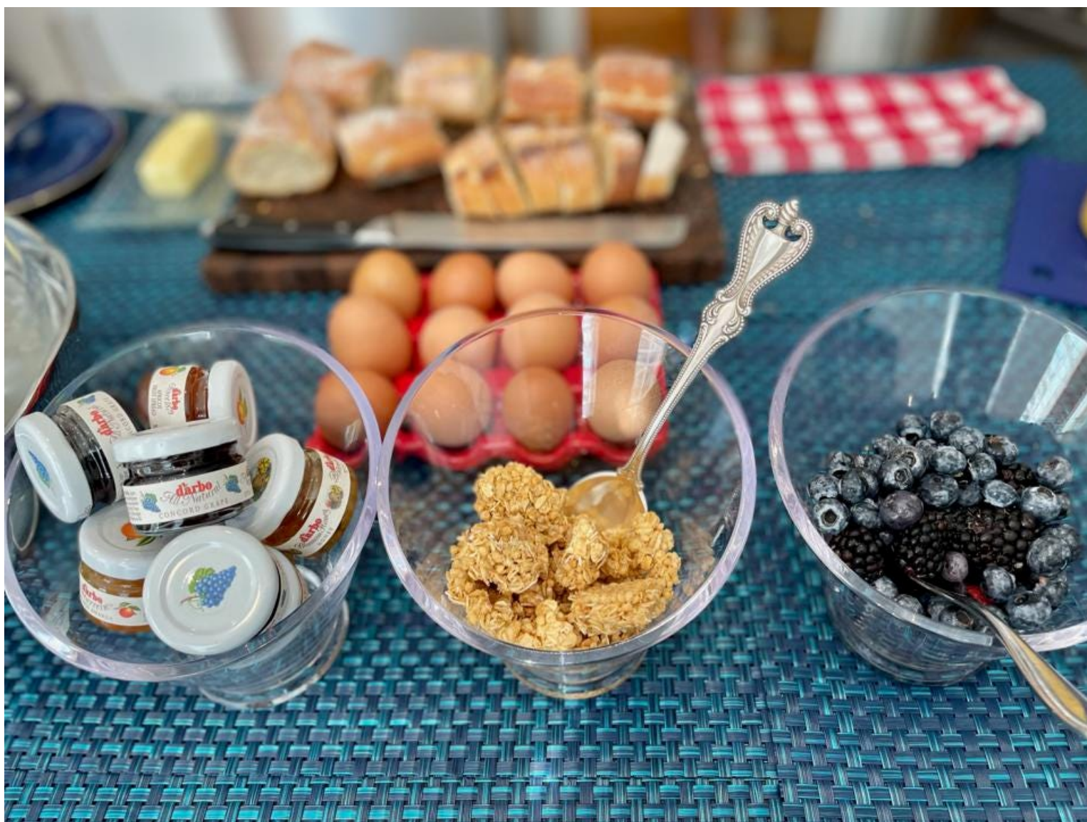
Seven on Shelter Island's complimentary breakfast